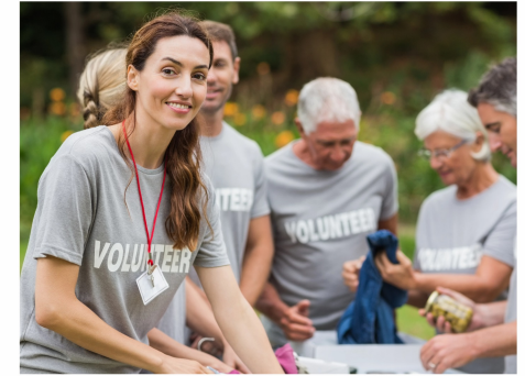
Donec a dapibus nibh. Quisque fringilla mattis dui.

Phase 1 of the building campaign started on January 15, 2025 to end on June 8, 2025. The goal is to raise $5,000.00. The rector has pledged $2,500.00 and invites the congregation to match the other half. Please remember your donations to the Building Fund Campaign can still be made via our website ( www.stmichaelacc.org ) or by mailing your check to our post office box (P.O. Box 315, Buckeystown, MD 21717) or by mailing your check directly to Lynne Brisbane at 3500 Basford Rd., Frederick, MD 21703. We encourage everyone to continue to support the church by sending your offerings (collection) to the treasurer. This can be done via our website ( www.stmichaelacc.org ), mailing a check to our post office box (P.O. Box 315, Buckeystown, MD 21717), by mailing your check directly to Lynne Brisbane at 3500 Basford Rd., Frederick, MD 21703, or of course, by placing your donation in the alms plate during the Offertory at Mass on Sundays.